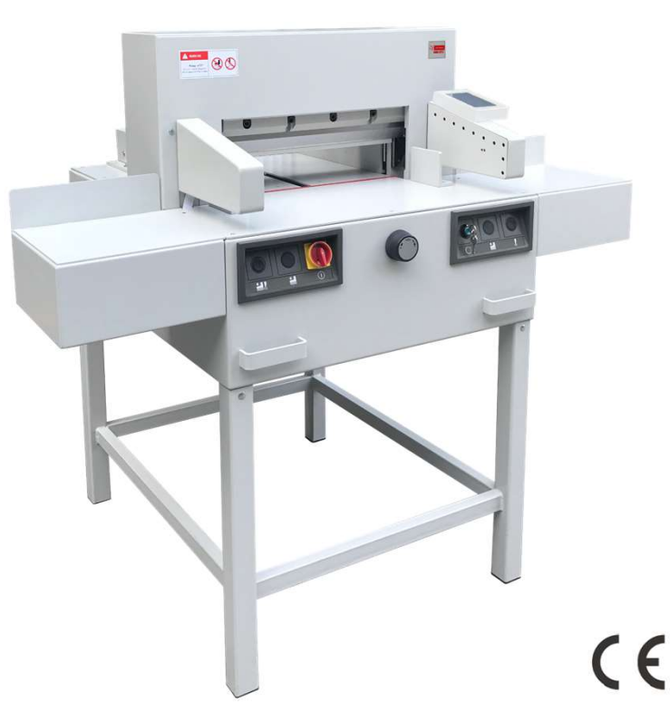
intimus 4680 EPS with side tables